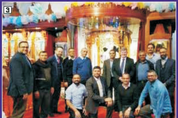
(1) Deepawali Annakut Darshan in our temples at Auckland (New Zealand), Sine Mansion (America), Admission (Canada), New York (Chapter) temples. (2) Haribhaktias celebrating Tuls Vivah in Helmiton (New Zealand) chapter temple. (3) Our devotees alongwith Indian High Commissioner who visited temple for divine Darshan in Harrow (Canton) temple.

•Shree Swaminarayan temple, Naranpura Ahmedabad. Rajat Jayanti Mahotsav from 09/02/2019 to 15/02/2019. •Shree Swaminarayan temple, Ponda Bhatara (Kathliar). Murti Pratistha Mahotsav from 04/02/2019 to 10/02/2019. •Shree Swaminarayan temple, Zundal. Murti Pratistha Mahotsav from 14/02/2019 to 20/02/2019.