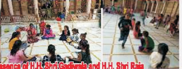
Balika Shibir in Kalapur temple in auspicious presence of H.H. Shri Gadivala and H.H. Shri Raja