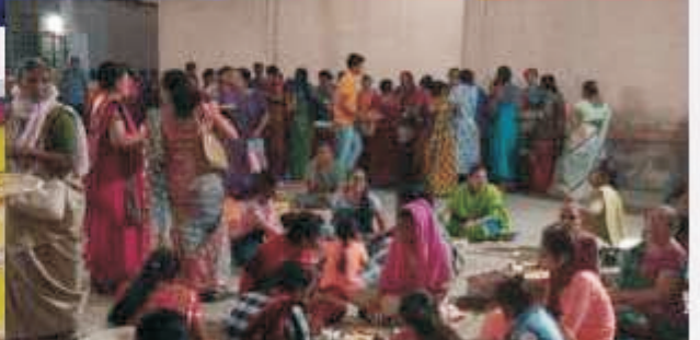
Cultural progamme In Asarwa Gurukul on the occasion of Ekadashi Dasabdi Mahotsev