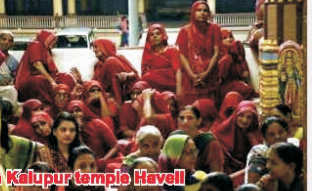
Ekadashi Jagran Sabha In Kalapur temple Havell